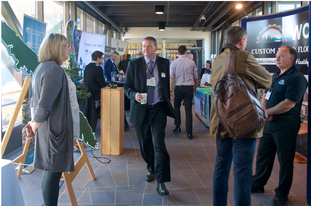
2019 Summit

We are excited to see you IN PERSON at the 16th annual 'State of the Island' Economic Summit to be held October 26 and 27 at the Vancouver Island Conference Centre in Nanaimo.