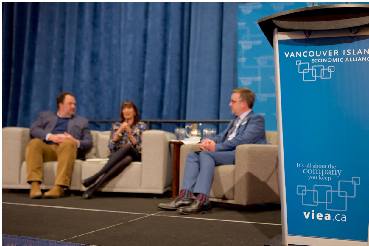
2019 Summit - Photo Credit: Dirk Heydemann

There are 2 days left to take advantage of Early Bird savings! Register for the Summit by midnight, Sunday July 31 & save!